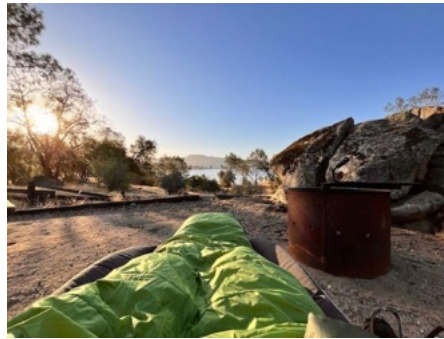
Actual morning view

I also attended, for the first time, the NCNC UCC Annual Gathering, held in Fresno last June. I combined the opportunity to attend this important gathering with self care by camping at a nearby state park. It was an all around educational and restorative experience.